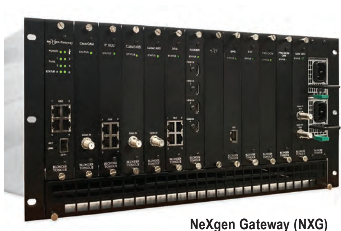
NeXgen Gateway (NXG)

the new products and new system solutions to be those that will enable us to expand sales to the large Tier 1 and Tier 2 service providers.