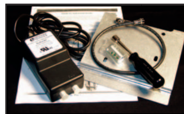
TVCB-PC Self Install 9111

This kit includes everything needed for easy installation by the consumer. Items included are the TVCB-PC unit and installation guide (9110), the TVCB Power Pack (9126), the TVCB wall-mounting bracket (9135A), and the TVCB Accessory Kit (9136). To order the TVCB-PC Self Install kit, be sure to specify stock number 9111 when ordering.